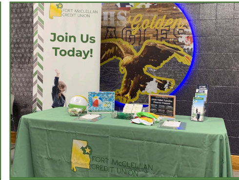
Institute Day for Jacksonville