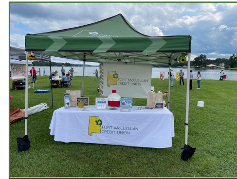
Bulls on the Lake Rodeo

LIKE us on Facebook to stay up to date on our current events!