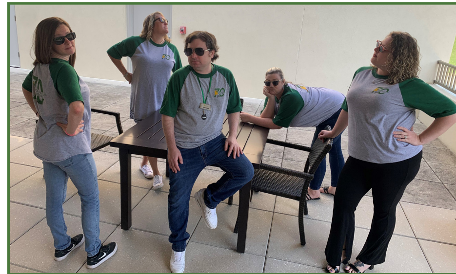
Staff is LOVING our summer gear!

We look forward to seeing you at the next event!