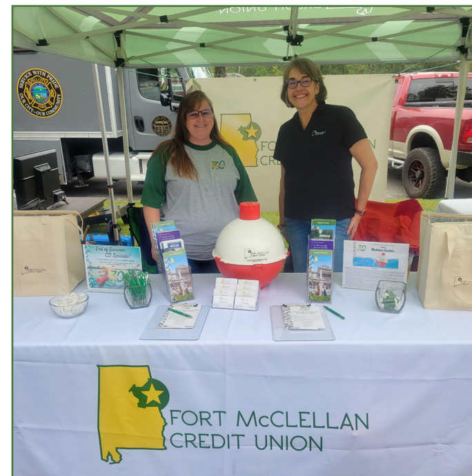
Lakeside Live Musicfest