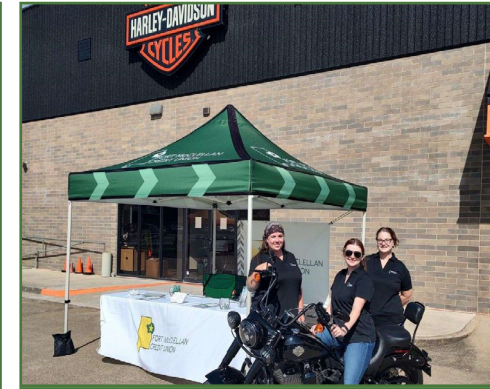
Rumble on the Loop Hooligan Harley