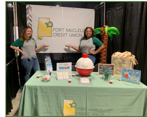
Etowah Business EXPO