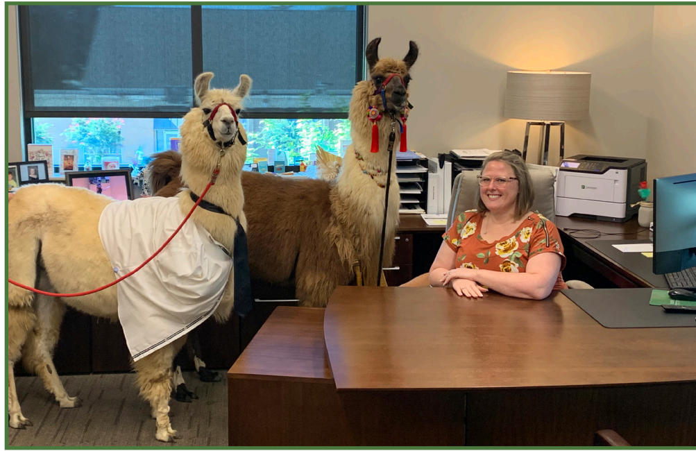
FMCU had some surprise visitors from Redbird Willow Farm!