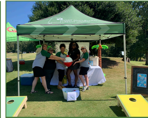
Salute to Industry