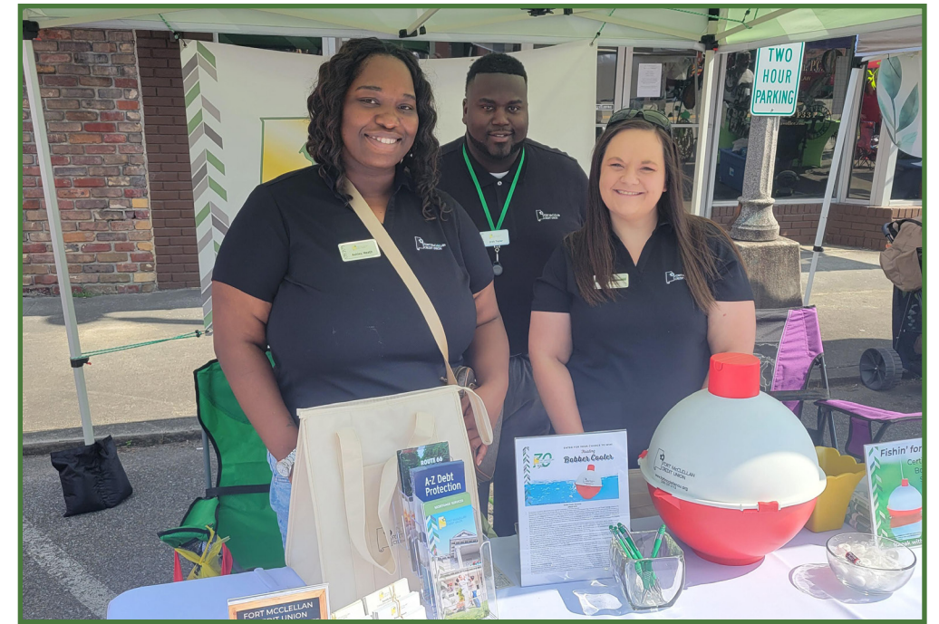
FMCU loved participating in the 2023 Pell City Hometown Block Party!