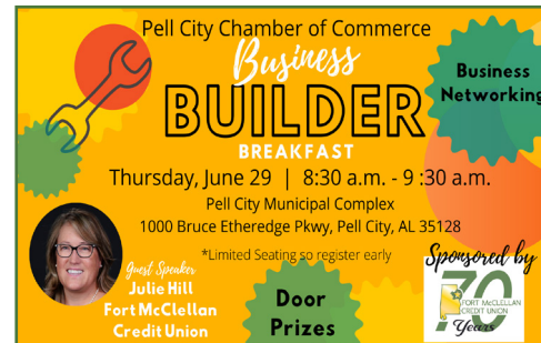
Pell City Business Builders Breakfast