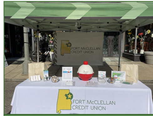
Noble Street Festival