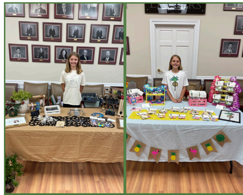
Youth Entrepreneur EXPO