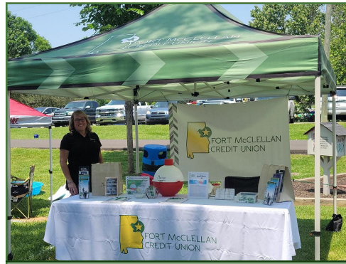
Creek Bank Festival