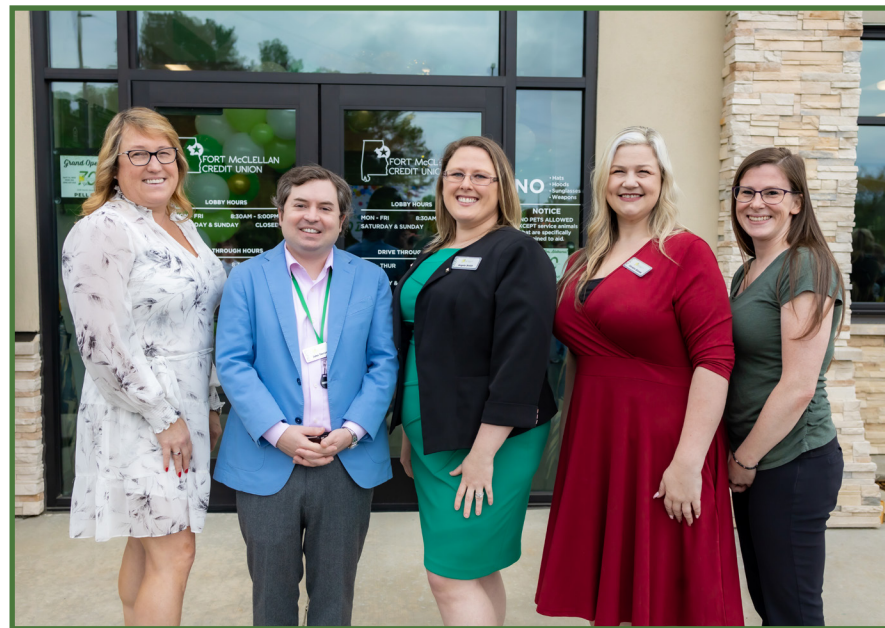
FMCU's Senior Management Team at our Pell City Grand Opening.