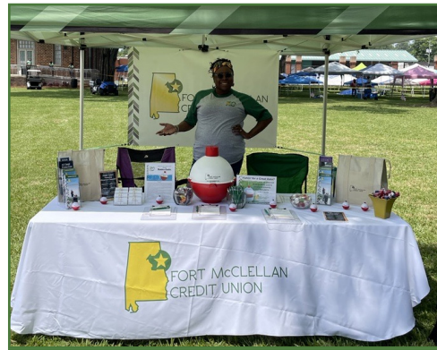
Anniston Heritage Festival