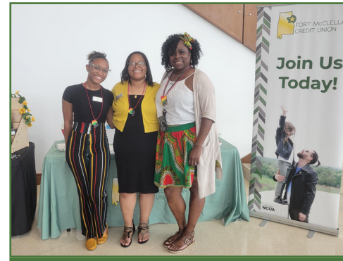
JSU Juneteenth Celebration