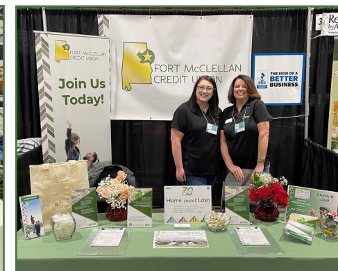
Birmingham Home Show