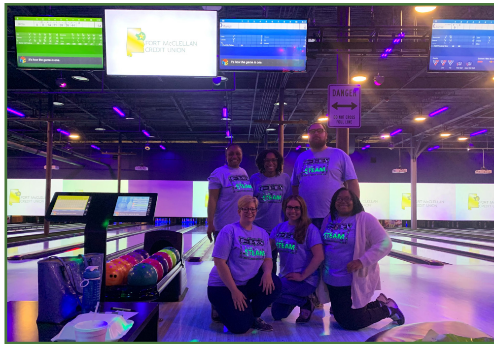
FMCU was a Strike Sponsor for Big Brothers Big Sister's 2023 Bowl for Kids' Sake Event.