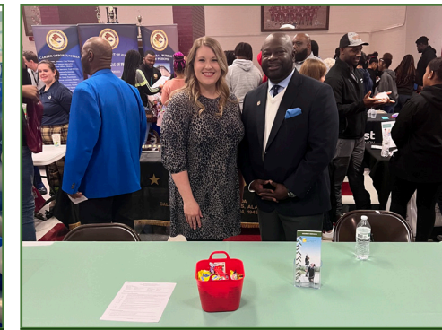
Anniston Career Fair