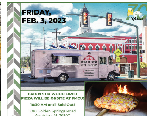
Food & Finances

With each event, we are given the opportunity to enrich our community so that we can pursue excellence, one member at a time.