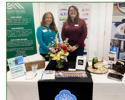
Calhoun County Chamber Events

LIKE us on Facebook to stay up to date on our current events!