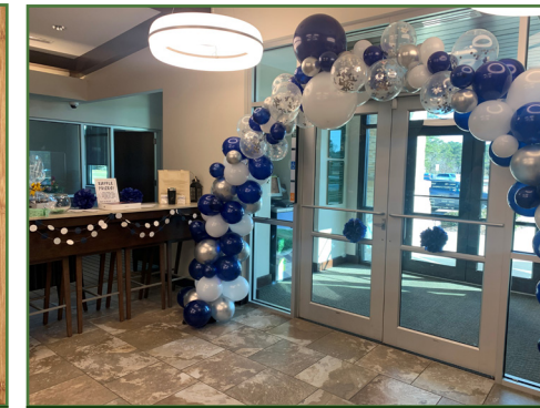
FMCU Staff Celebration